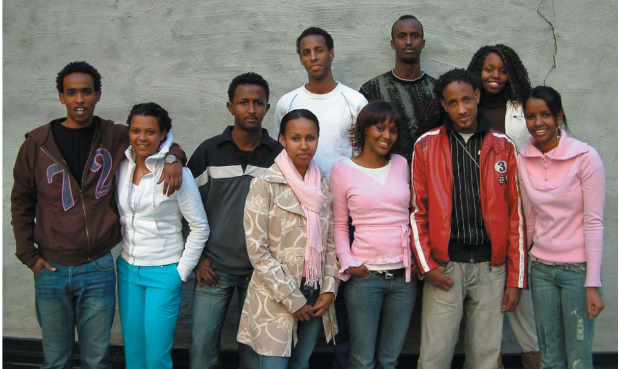
Participants in the living-in-Norway course