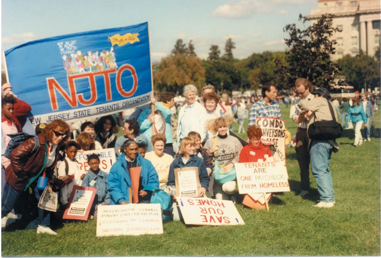
1989, NJTO rallying in Washington D.C.