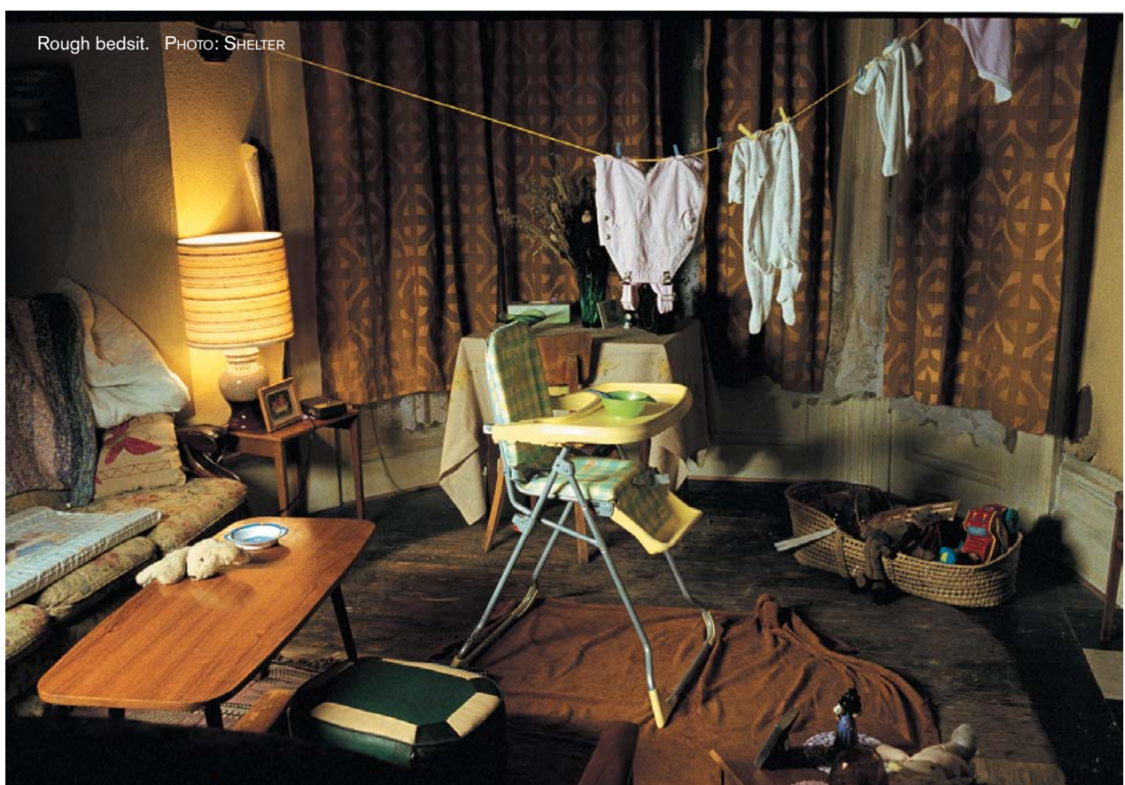
Rough bedsit.

But the big change introduced in the new Act will force landlords to obtain a licence for larger HMOs. This will give environmental health officers a much better chance of uncovering those that do not provide safe and satisfactory accommodation. At the moment, officers have to spend too much time trying to find HMOs and then enforcing physical and management standards in them.