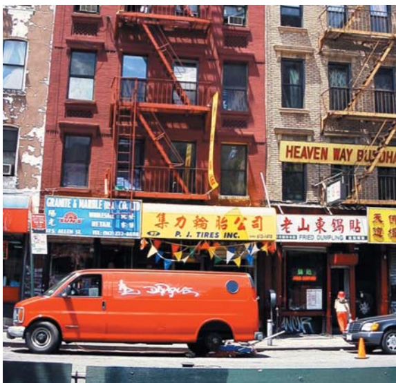
Tenement house in Chinatown, New York.

The city's housing commissioner, says that the city's overall housing stock and the number of homeowners in New York are both at a record high, but acknowledged that city tenants are facing a painful spiral of rising rents and falling wages. The study found that real income in New York fell by 6.3 percent from 2001 to 2004, whereas it increased by 9.8 percent from 1998 to 2001. These figures were accompanied by a 5.4 percent increase in the median monthly rent from 2002 to 2005.