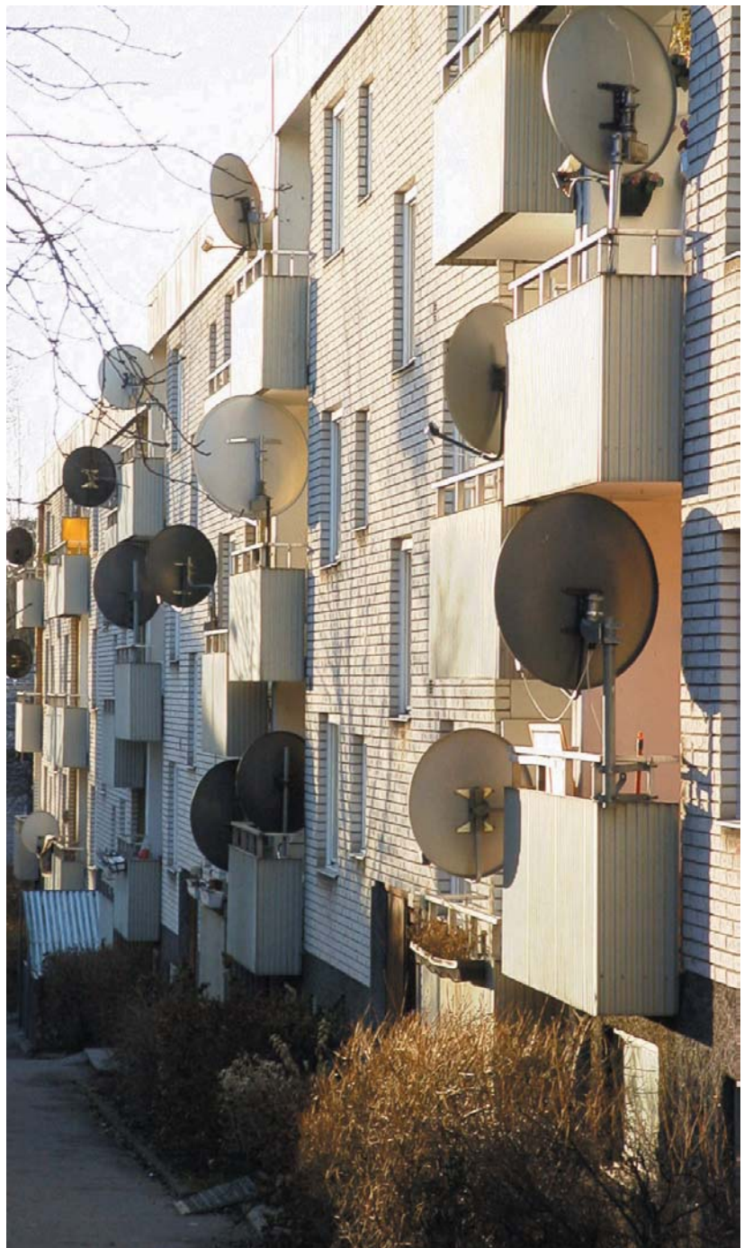
What does the EU say about the "right to information"?

The Treaty contains provisions on matters such as common monetary policy, a central bank, an investment bank and a co-ordinated policy on